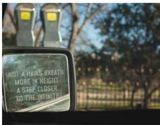
Images of Magid's Mercedes, which was armored to withstand the gunfire common in war zones. The car is parked at the Capitol in the same space used by Fausto Cardenas. A quote from the play Faust is on the side mirror. In Failed States , Magid compares Cardenas to the protagonist of Goethe's play.

to show them you're not useful. Let everything out because you don't know anything important.